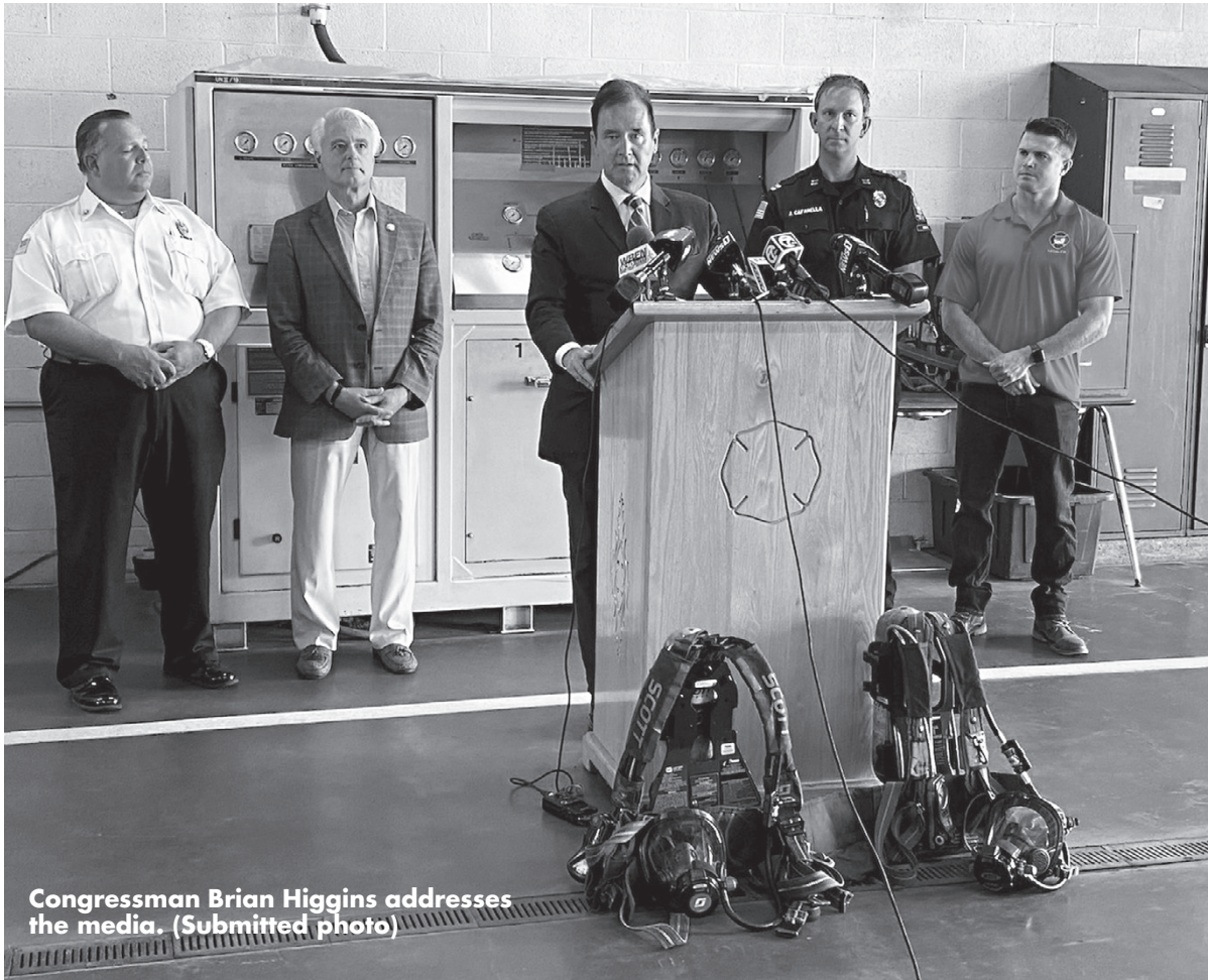
Congressman Brian Higgins addresses the media.

The City of Niagara Falls will use the grant funding to purchase 36 new self-contained breathing apparatuses (SCBAs) for firefighters, as well as a filling station for the devices. The Niagara Falls Fire Department's existing airpicks were 20 years old and scheduled to expire under existing safety standards this year. The department's air-filling station was more than 25 years old and recently broke, requiring Niagara Falls firefighters to take their tanks to a North